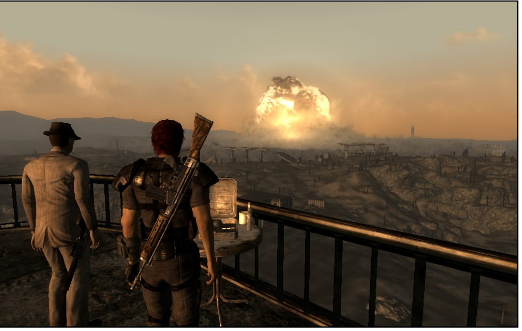
Fallout 3: Destroying Megaton

One of the most disturbing quests in the game involves deciding whether to detonate or disarm a nuclear device in a small town called Megaton. The player can either kill all the residents and annihilate the town by detonating the weapon or save everybody by permanently disarming it. Consequently, parents were less than pleased when they found out that their children were responsible for killing hundreds of people, even