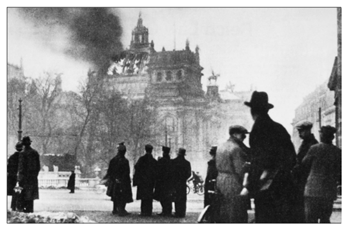
Reichstag on fire