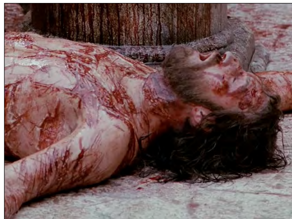
The Passion of the Christ Icon Productions ©2004