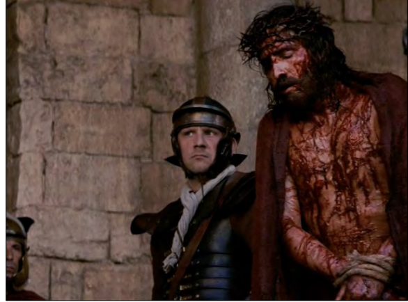
The Passion of the Christ Icon Productions ©2004

The prophetic words of Jesus continued to be fulfilled.